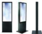
Totems TOT-XXX80H-IR10 TOT-XXX80H-CA10