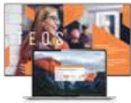
TEOS Connect license TEC-SC100